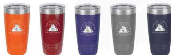
Orange Maroon Purple Dark Gray Navy Blue