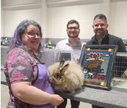
Continued photos of Angora Wins at West Coast Classic