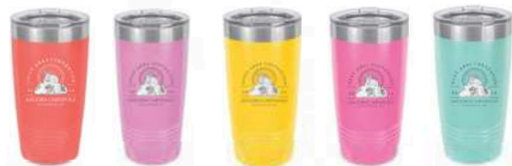
Coral Light Purple Yellow Pink Teal