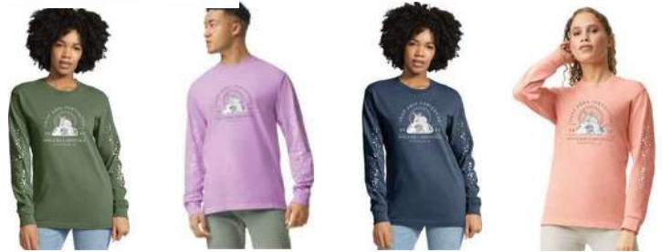
Hemp Neon Violer Denim Peachy