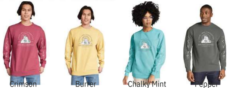
Crimson Butter Chalky Mint Pepper