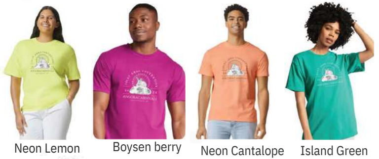
Neon Lemon Boysen berry Neon Cantalope Island Green